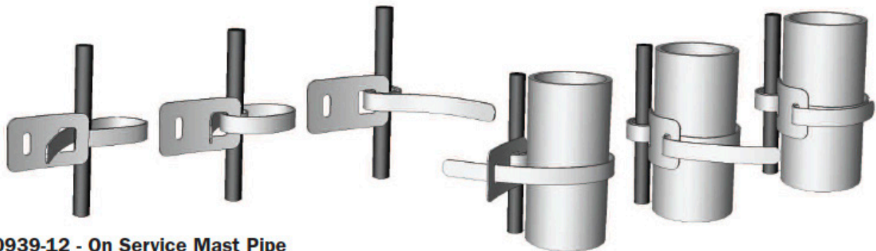
SI-0939-12 - On Service Mast Pipe

Aluminum Cable Ties, compared to Plastic Cable Ties, will not compress or kink the cable, and will prevent fracture of the sheathing due to repeated flexing of the cable under extreme hazards. Over time, Plastic Cable Ties will cause micro-reflections and impedance mismatch resulting in a significant decrease in signal clarity.